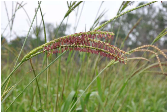
Figure 1 Eastern gamagrass seed head during pollination